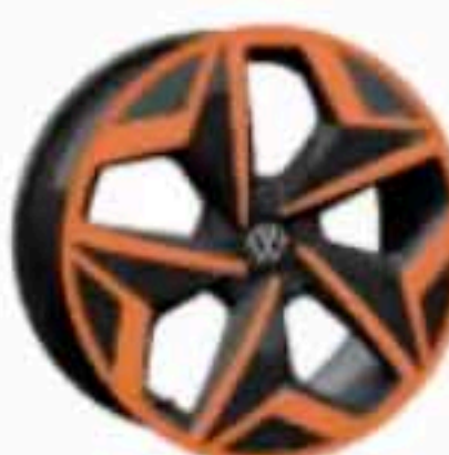
Andoya in Penny Copper machined (alloy wheel, also for winter tyres)