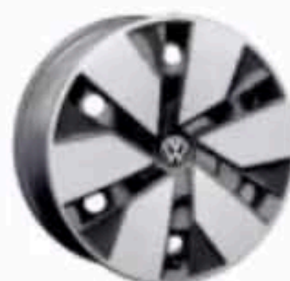
Steel wheel (optional in "Exterior Style" package, also for winter tyres)