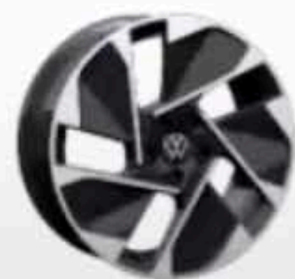
East Derry machined (alloy wheel, also for winter tyres)