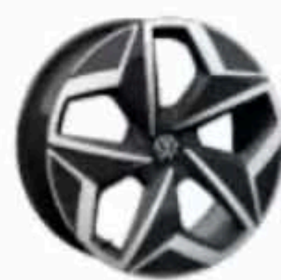
Andoya machined (alloy wheel, also for winter tyres)