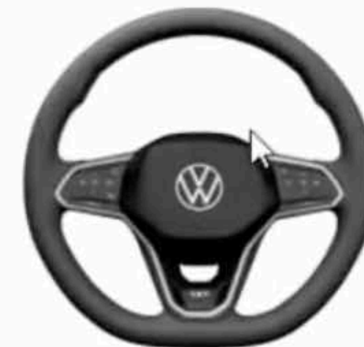
Black (Leather*) 1 ST Edition