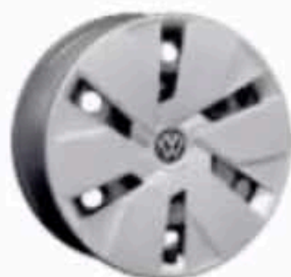
Steel wheel (Basic)