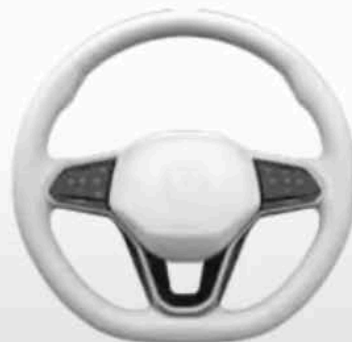
Electric White (Leather*)