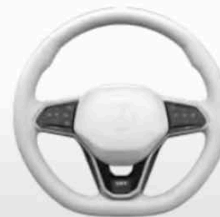
Electric White (Leather*) 1 ST Edition

*Replacement with animal-free alternative within lifecycle under evaluation.