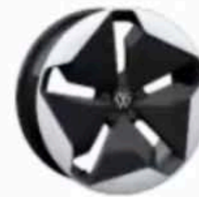
Sanya machined (alloy wheel)