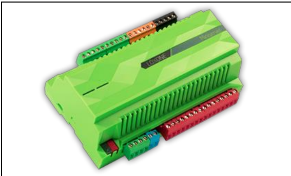
Loxone MiniServer (example)