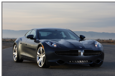
PHEV and EV Passenger Vehicles