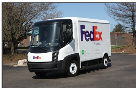
PHEV and EV Commercial Vehicles